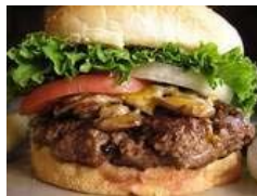
PHOTO GALLERY Metro Detroit's best burgers We asked readers to point us toward Detroit's best hamburgers. Six weeks later, here are our favorites.

WITH VIDEOS 2009 Restaurant of the Year Iron Chef Michael Symon's Roast gets the Free Press' nod for metro Detroit's top eatery of the year.