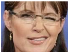
PHOTO GALLERY 2008: The year in pictures Take a look back at the year that was in this chronological look at the biggest events and best photos.